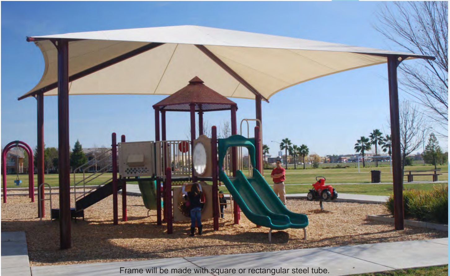
Frame will be made with square or rectangular steel tube.

Hipped fabric shade shelters, in both square and rectangular shapes, bring stylish shade at affordable prices. The light weight of the fabric top permits structural simplicity allowing large areas of coverage with maximum clear interior space and minimum physical obstructions.