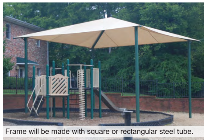
Frame will be made with square or rectangular steel tube.