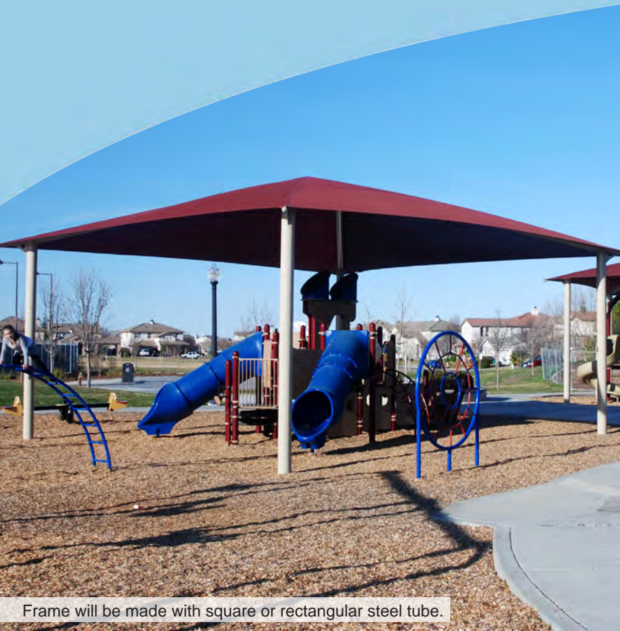
Frame will be made with square or rectangular steel tube.